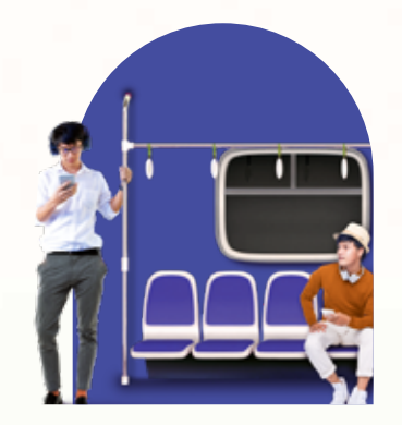
Connected to MRT & LRT Stations