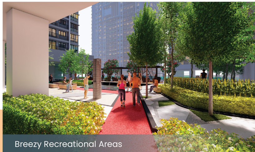
Breezy Recreational Areas