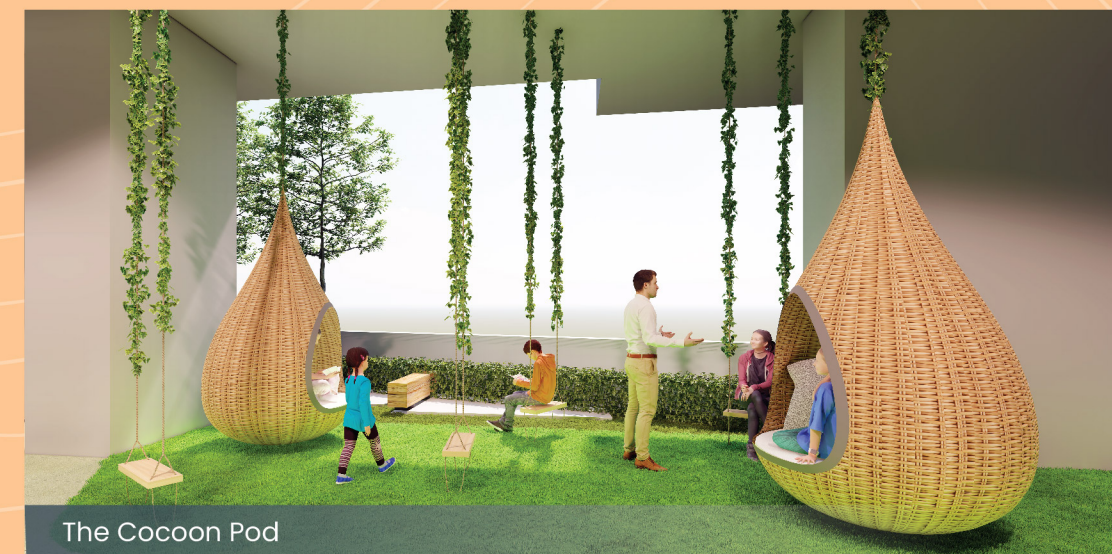
The Cocoon Pod