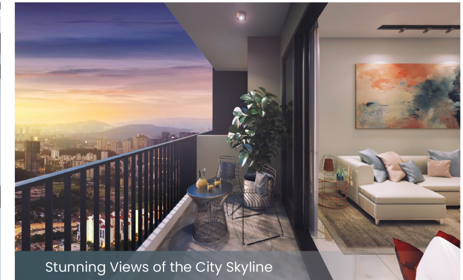
Stunning Views of the City Skyline