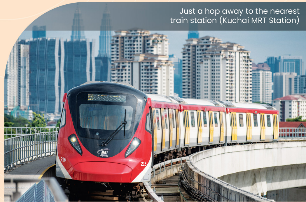
Just a hop away to the nearest train station (Kuchai MRT Station)