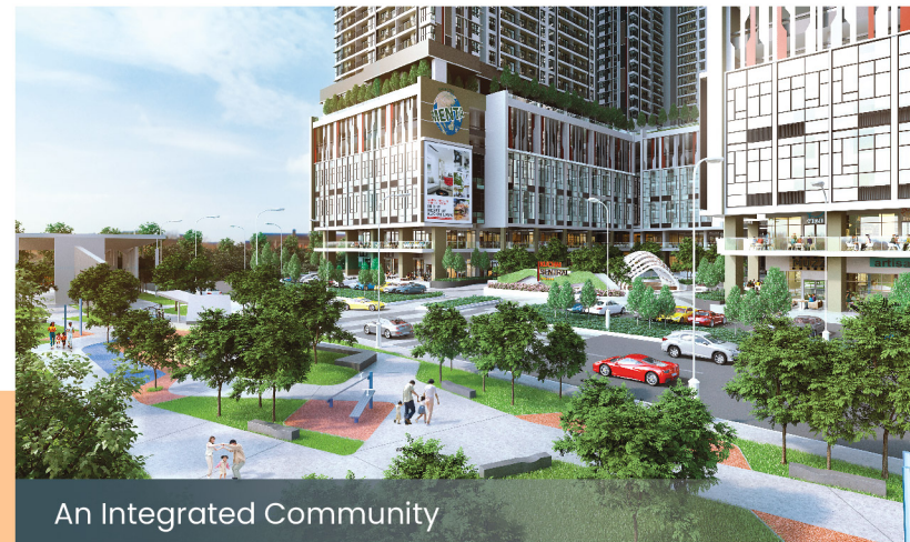
An Integrated Community