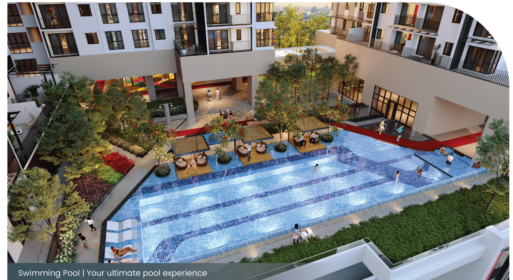
Swimming Pool | Your ultimate pool experience