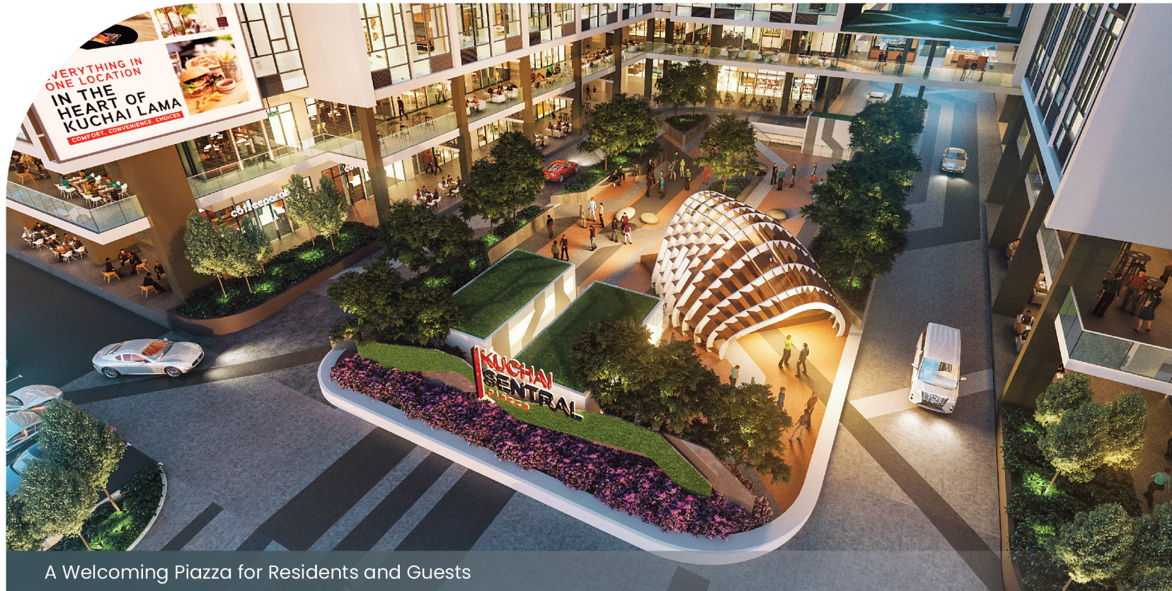
A Welcoming Piazza for Residents and Guests