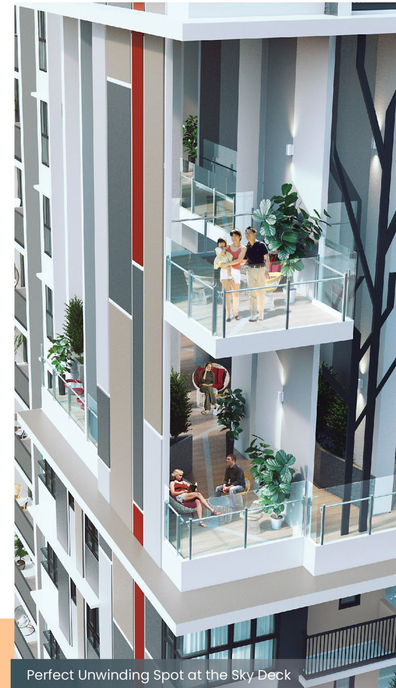
Perfect Unwinding Spot at the Sky Deck