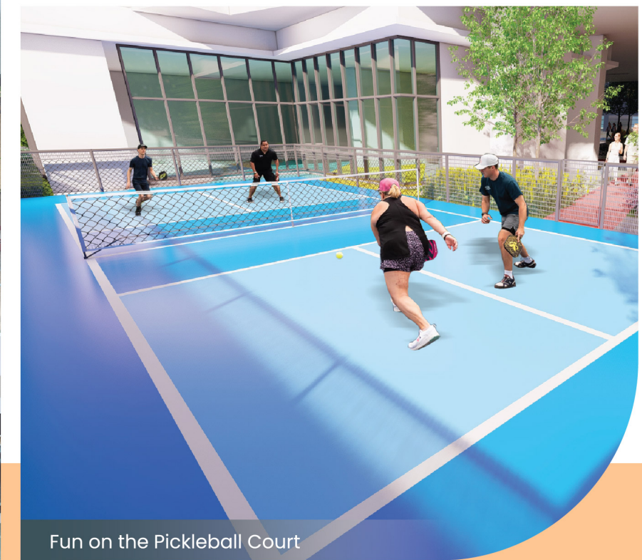
Fun on the Pickleball Court