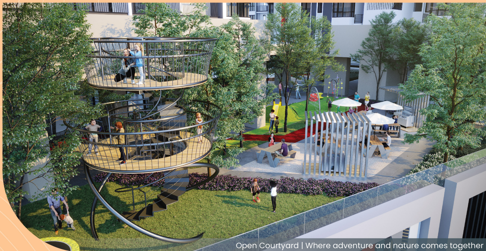
Open Courtyard | Where adventure and nature comes together