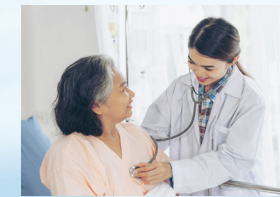
World-Class Medical Institutions