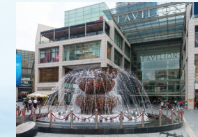
Branded Shopping Malls