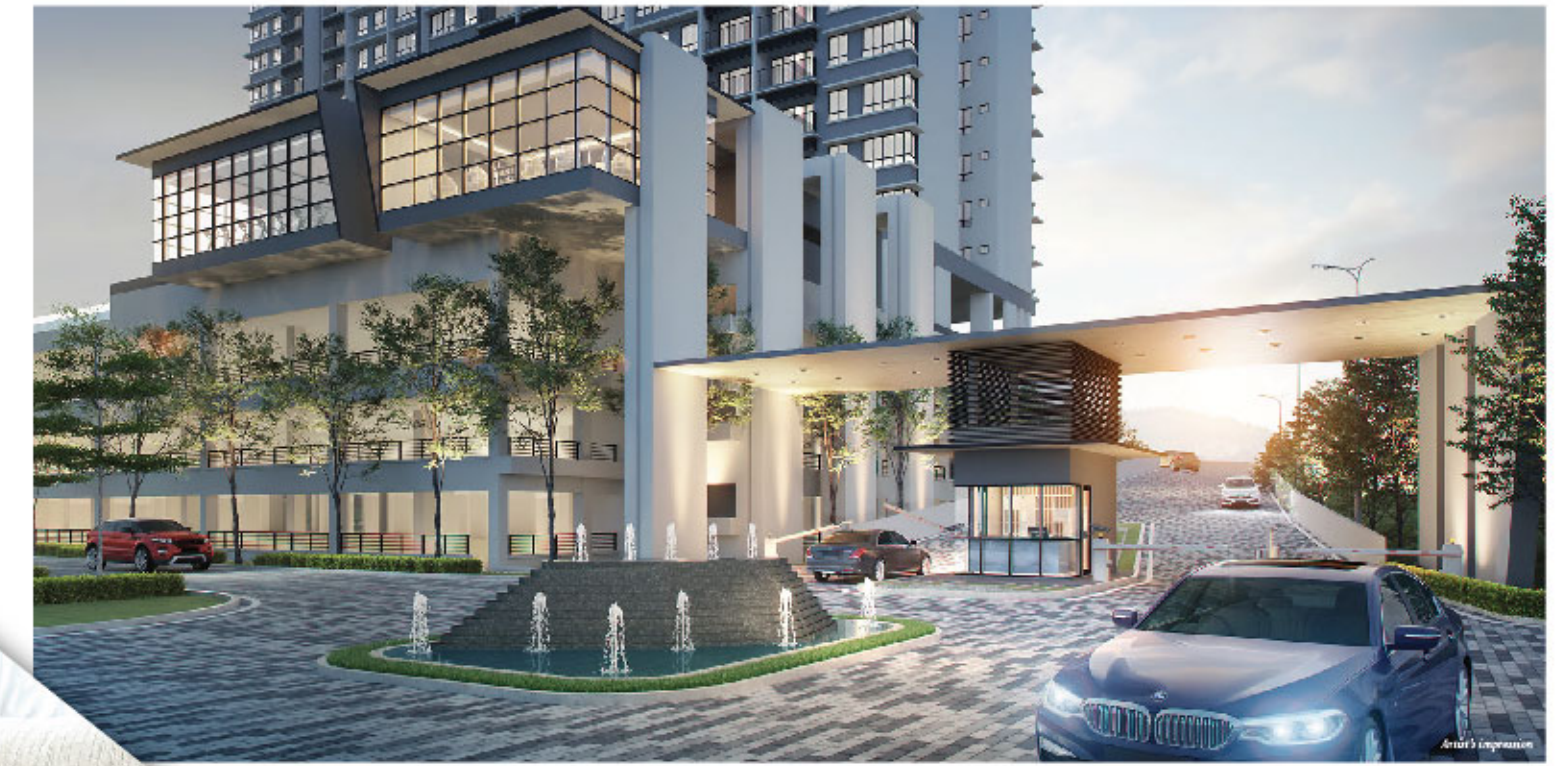
Greeting of grandeur and style upon arrival

Smartly designed to showcase an appealing blend of urban chic, the sleek silhouette of the 24-storey Aster Residence accentuates its presence against the wraparound verdant setting, with a grand entrance statement to match.