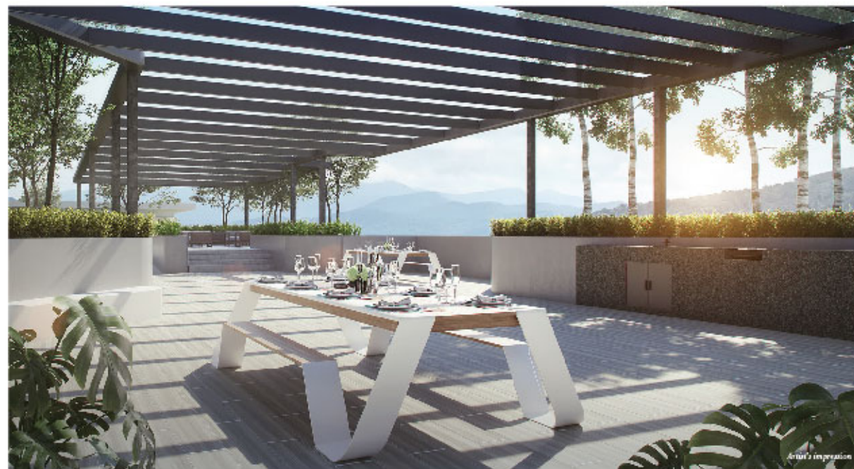
A cozy green spot for unwinding, relaxing and rejuvenating

A green community with a spectacular golf course, Bandar Sungai Long makes for healthy exercises such as cycling and hiking, or just a stroll along tree-lined paths. While nature is literally at your doorstep, so are fresh produce, supplies, eateries, banks, schools, clinics and more.