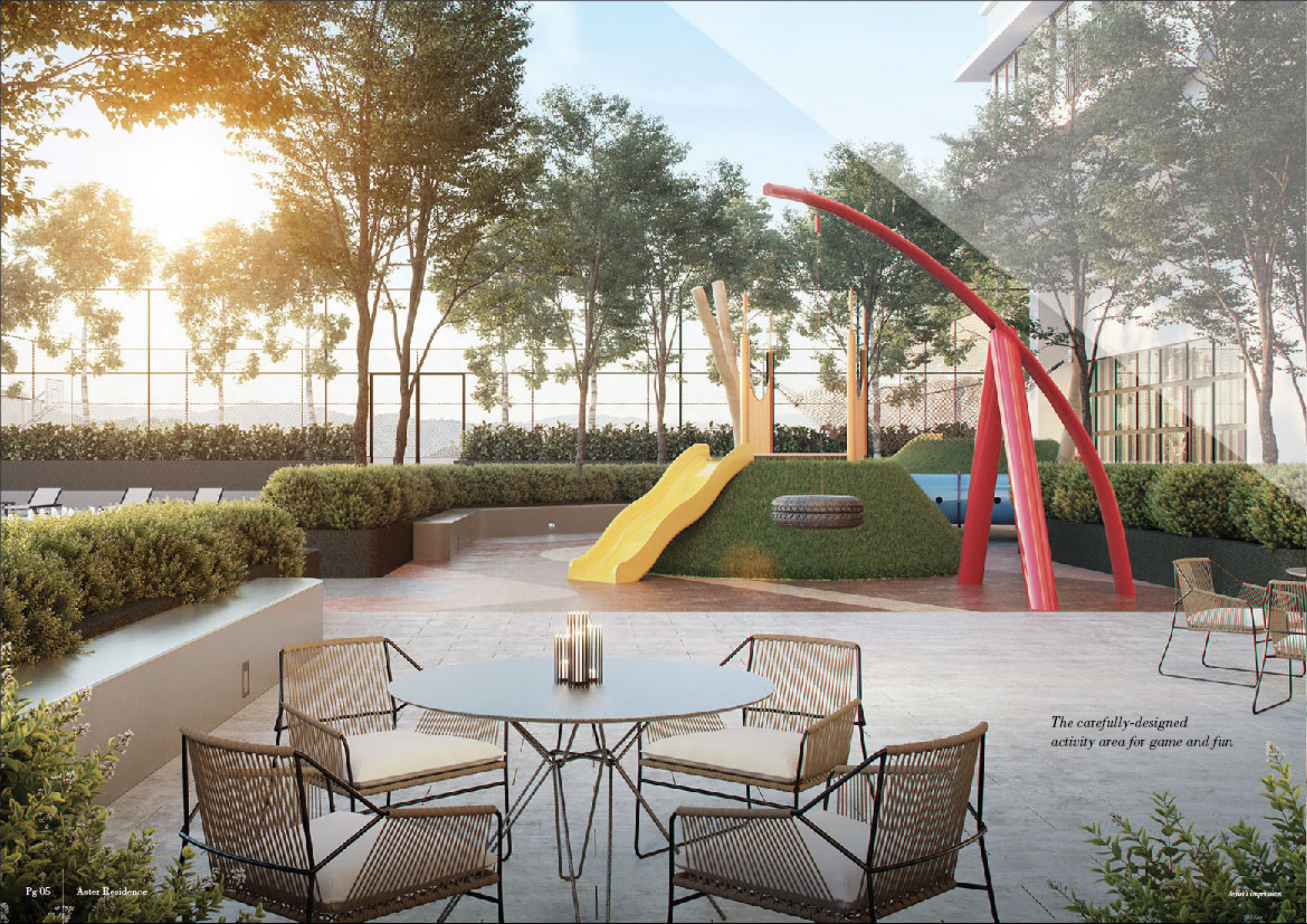
The carefully-designed activity area for game and fun.