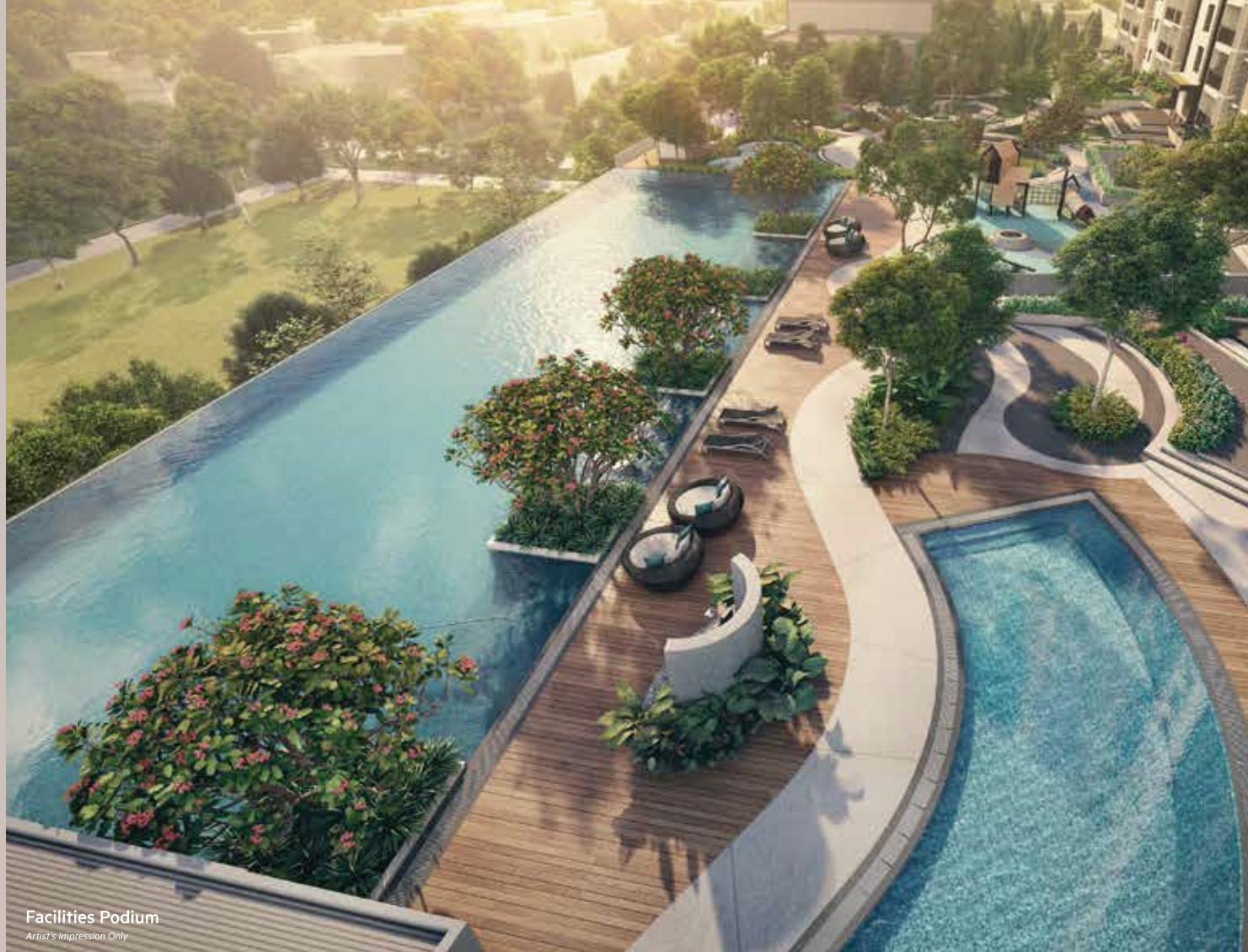
Facilities Podium Artist's Impression Only