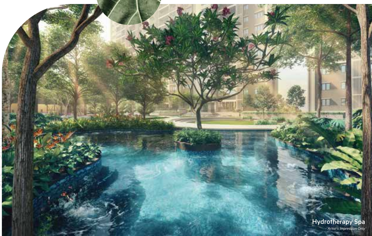
Hydrotherapy Spa Artist's Impression Only