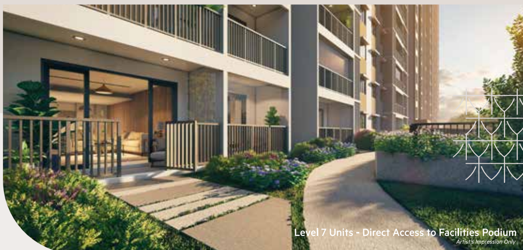
Level 7 Units - Direct Access to Facilities Podium Artist's Impression Only

Embrace a life of calmness with your loved ones surrounded by meticulously thought-through designs where the abundance of nature-inspired green landscaping and water features be the salve for the soul after a long day.