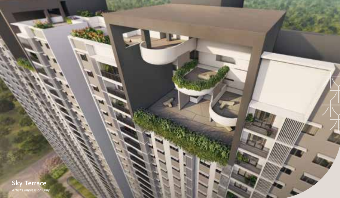
Sky Terrace Artist's Impression Only